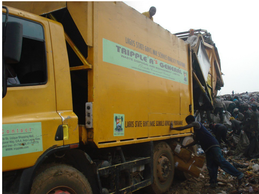
Figure 1.4: Scavengers busy at the dumpsite at Olusosun, Lagos State, Nigeria.