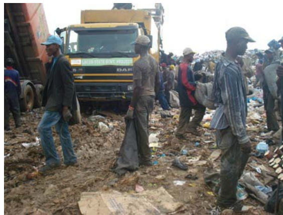
Figure 5.1: Waste collectors/recycler at work at the Olusosun Dumpsite, Lagos.

A 96% Local Recyclers (waste scavengers) agreed that scavenging does have a positive impact on their financial status. This implies that scavenging for electronic parts was mainly carried out by individuals in the Local Recyclers (waste scavenging) profession. At the dumpsite in Olusosun, waste pickers (Local Recyclers) sort waste according to their importance and types. These are subsequently bought by manufacturers and private companies as attested by the Chairman of Scavengers Association (see Table 5.1) “we sell them to manufactures and factories. For example, the bottles go to glass companies and sometimes drug manufacturers.”