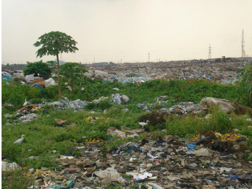
Figure 1.3: The dumpsite at Olusosun, Lagos State, Nigeria occupies over 42 hectares of high walled land