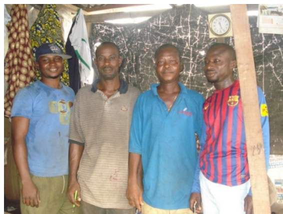
Figure 5.2: The Chairman of Scavengers Association (3rd from left) and his executives at the Olusosun dumpsite, Lagos State