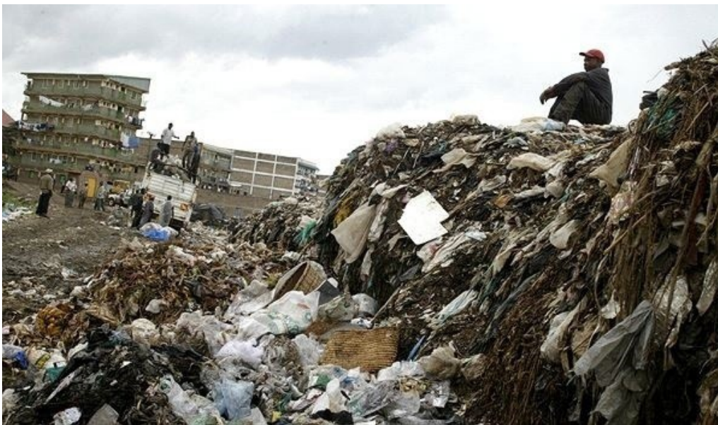
Figure 1.2: Dandora Dump site, Nairobi, Kenya.

Until recently, it never occurred to me that one of my very favorite electronic gadgets, my mobile phone, may be a source of happiness or pain to some child somewhere else in the world. This may be regarded as a momentary case of self-reflection but the reality, once I got curious enough to search the web pages of the Internet was quite daunting not to say alarming at the least. My curious search led me to a dumpsite in Nairobi, Kenya. Dandora, as the dumpsite is known, is one of Africa's largest dumpsite with the expanse of land measuring 30 acres, filled with both electronic and solid waste from all parts of Nairobi, its environ and across the Kenyan border. The site was intended to fill up an old quarry but increased popularity made it a mountainous dumpsite. As a measure of eliminating the growing volume of waste, the inhabitants result to burning which leaches hazardous chemicals into the soil and the Nairobi River flowing next to the site (Njoroge, 2007).