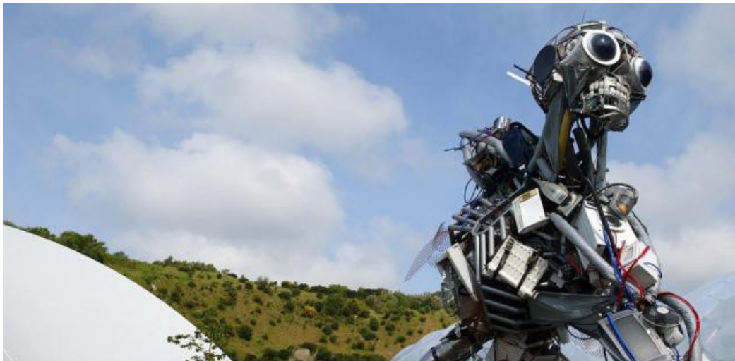
Figure 1.1: The WEE Man

Nine out of every ten homes possess an obsolete electronic device such as an outdated computer, a refrigerator or a mobile phone. It is probably covered in dust, lying at the base of your cabinet or trash can and grimy from lack of use. Obsolete electronic devices or electronic waste (also referred to as e-waste) are becoming common sites everywhere, giving birth to what some experts are predicting to be the largest toxic waste problem of the 21st century (Schmidt, 2002). To illustrate just how much of e-waste we tend to generate, Paul Bonomini, a contemporary artist designed and built what is now known as the WEE (e-waste) man (see Figure 1.1).